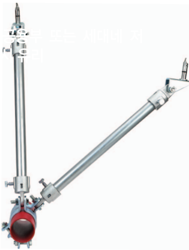
Horizontal Pipe Installation Type